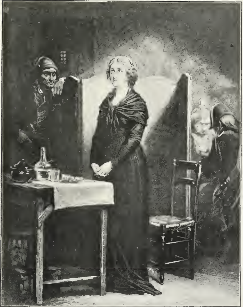
MARIE ANTOINETTE IN PRISON.